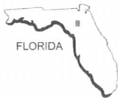
Figure 1 Site Location Map Cabot Carbon/Koppers Superfund Site, Gainesville, Florida