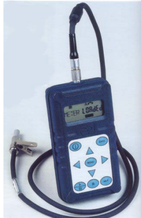
CEL-360 logging noise dosimeter

The CEL-360 data logging noise dosimeter is the most versatile noise-sampling instrument in the CEL range of personal noise meters. It is the ideal instrument for the professional occupational hygienist who wants to know whether the overall limit was exceeded during a working day. The data logging time history profile function adds the vital information to the run data by storing the changing pattern of noise levels to show exactly when significant events occurred.