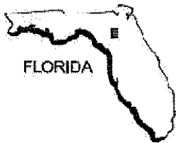
Figure 1-1. Site Location Map Cabot Carbon/Koppers Superfund Site, Gainesville, Florida